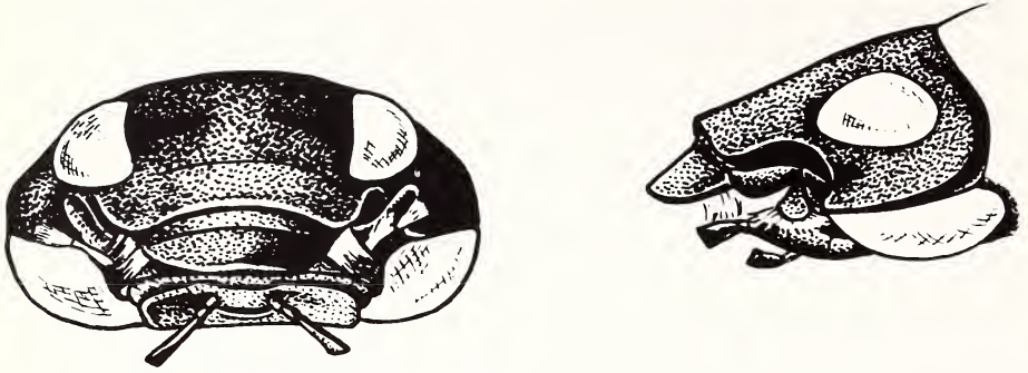
Fig. 1. Front and side views of the head region of Dineutes discolor , showing the separate dorsal and ventral pairs of compound eyes.

film are known to generate distinctive surface vibrations by their movements (Lang, 1980) which constitute an unusual stimulus available to any predator in contact with the water's surface.